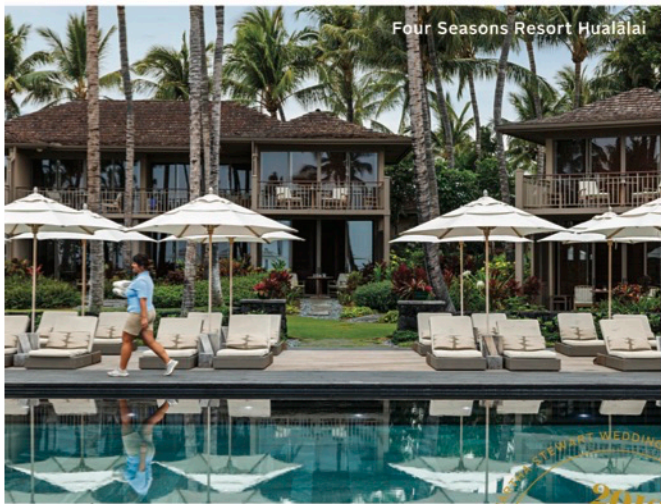
Four Seasons Resort Hualālai