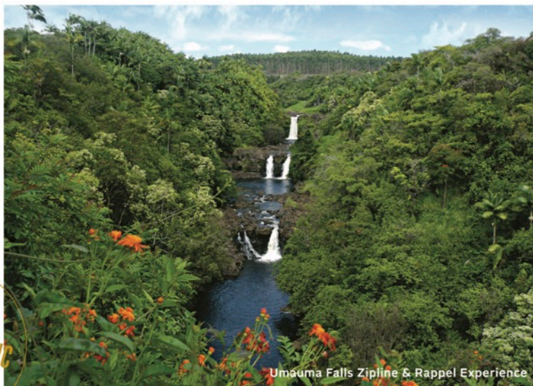
Umauma Falls Zipline & Rappel Experience